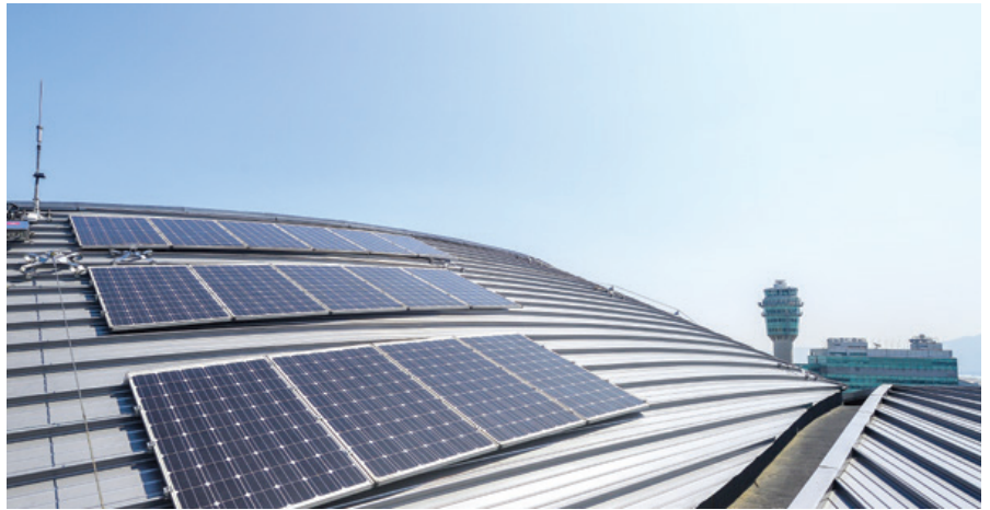
The AA is committed to HKIA's carbon reduction initiatives, such as the use of solar energy at the terminals. 機管局致力實踐機場減碳措施，例如於客運大樓應用太陽能。